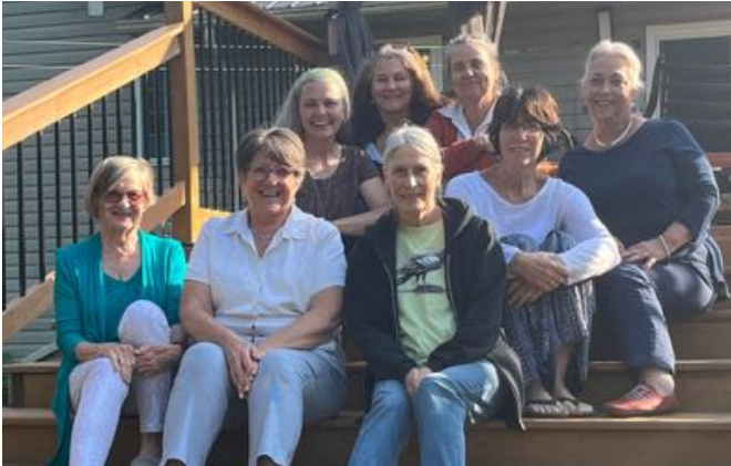
Steering Committee meeting, August 2023.