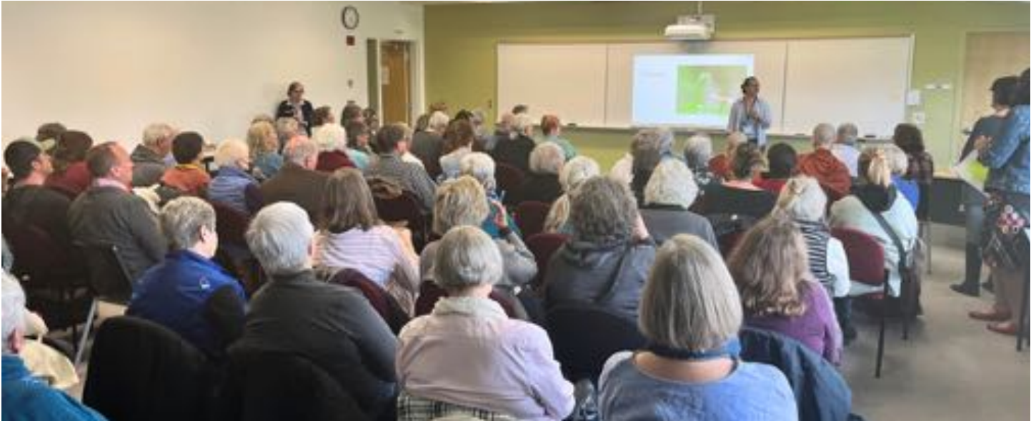
Community meeting - April 2023