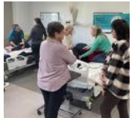
Volunteer training - spring 2024